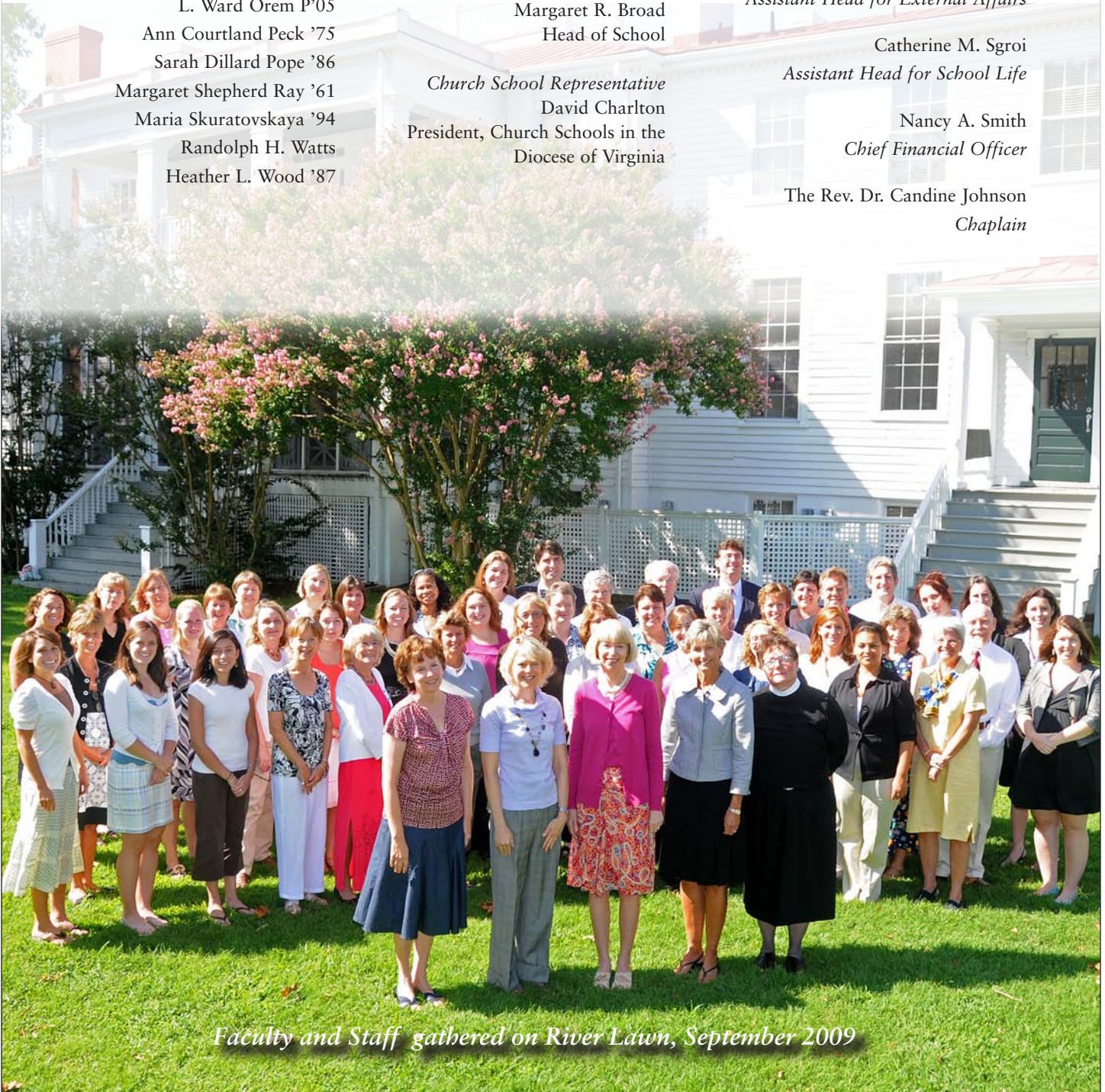
Faculty and Staff gathered on River Lawn, September 2009